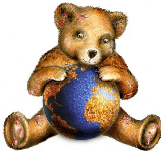
The WPD Teddy bear

Introduction of a new symbol/mascot: the WPD Teddy bear with psoriasis and an International Drawing Competition for Children were launched for World Psoriasis Day 2010.